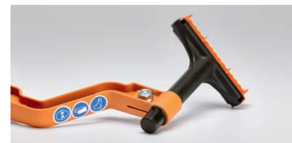
Rotatable impact element